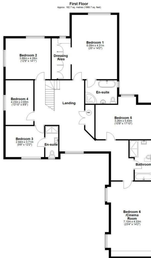
Total area: approx. 340.1 sq. metres (3660.8 sq. feet)